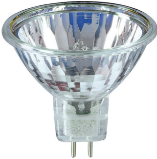
GU5.3, MR16, Open