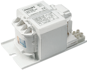
BSNE 70L 300I TS