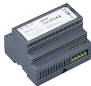
DDNP1501 Product shot