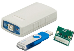
DTK622 Network Gateway