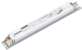
HF-P 136 TL-D III 220-240V 50/60Hz