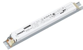
HF-P 236 TL-D III 220-240V 50/60Hz IDC